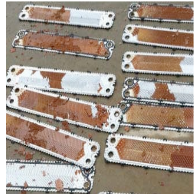
After 7 Days Maintenance Had To Be Carried Out

The exchanger maintenance was outsourced and disassembled and pressure cleaned on a weekly basis at a cost of $300 per visit.